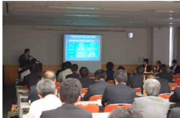
Parallel session, Conference room