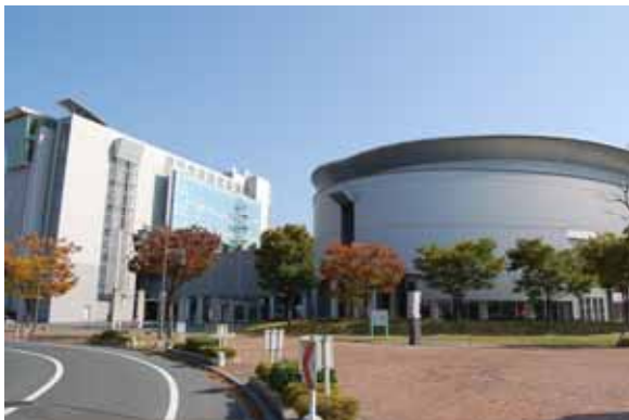
Venue, Yonago Convention Center