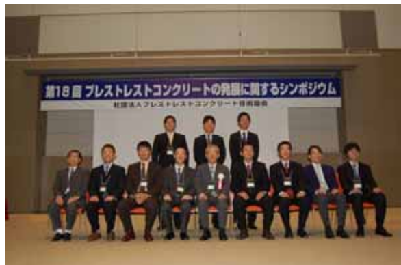
Award of excellent presentation