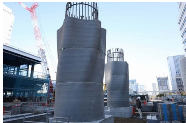
Fig. 4 Columns constructed using the printed formwork