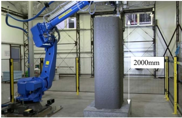
Fig. 1 Printing status of a 2-m-high column