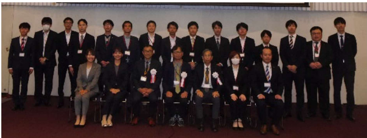
Award of excellent presentation