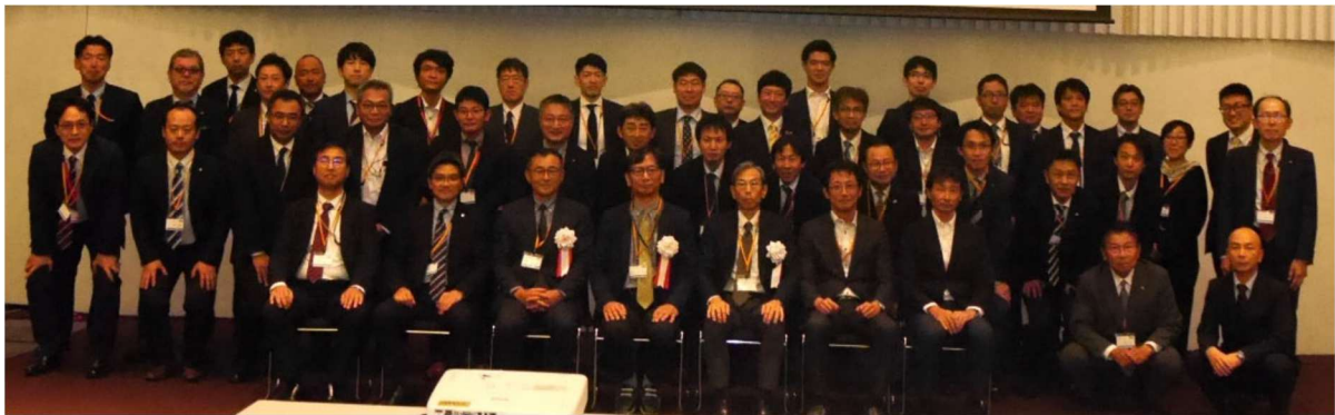
Closing Ceremony, Executive Committee Members