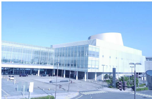
Venue, Toki Messe